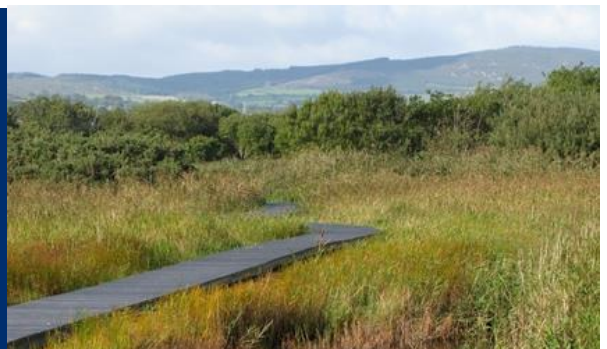
East Coast Wetlands & Nature Reserve, Newcastle

The Project Team would like to hear your views on the Emerging Preferred Route Corridor. Your comments will assist Wicklow County Council and our Design Team in the selection of a Preferred Route Corridor and the further Development of Options for the Greenway.