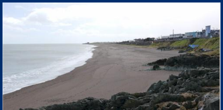
Greystones South Beach

The vision of Wicklow to Greystones Greenway is to create a walking and cycling path of greenway standard between Wicklow Town and Greystones that provides a safe and scenic experience for people of all ages and abilities. Integrating with and contributing to the existing and planned active travel network of County Wicklow, the greenway will enhance the health and economic opportunities for local communities while preserving and promoting the natural environment.